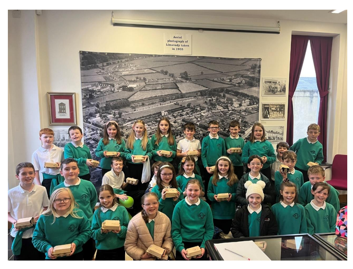
Pupils from St Patrick's and St Joseph's with their mini wildflower meadows.