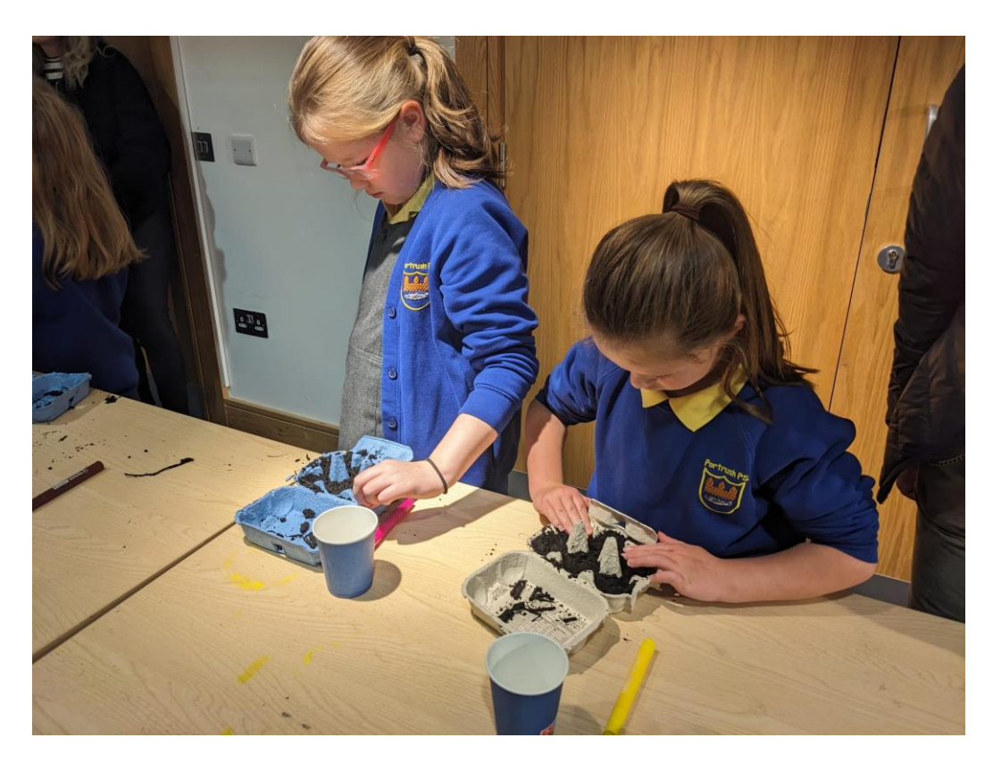
Pupils from Portrush Primary School carefully planting their mini-wildflower meadows.