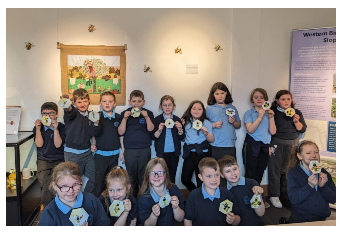
Pupils from Carhill Integrated Primary School with their bees.