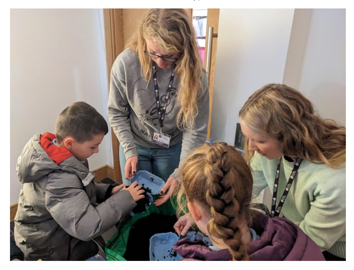
Filling egg boxes with compost.