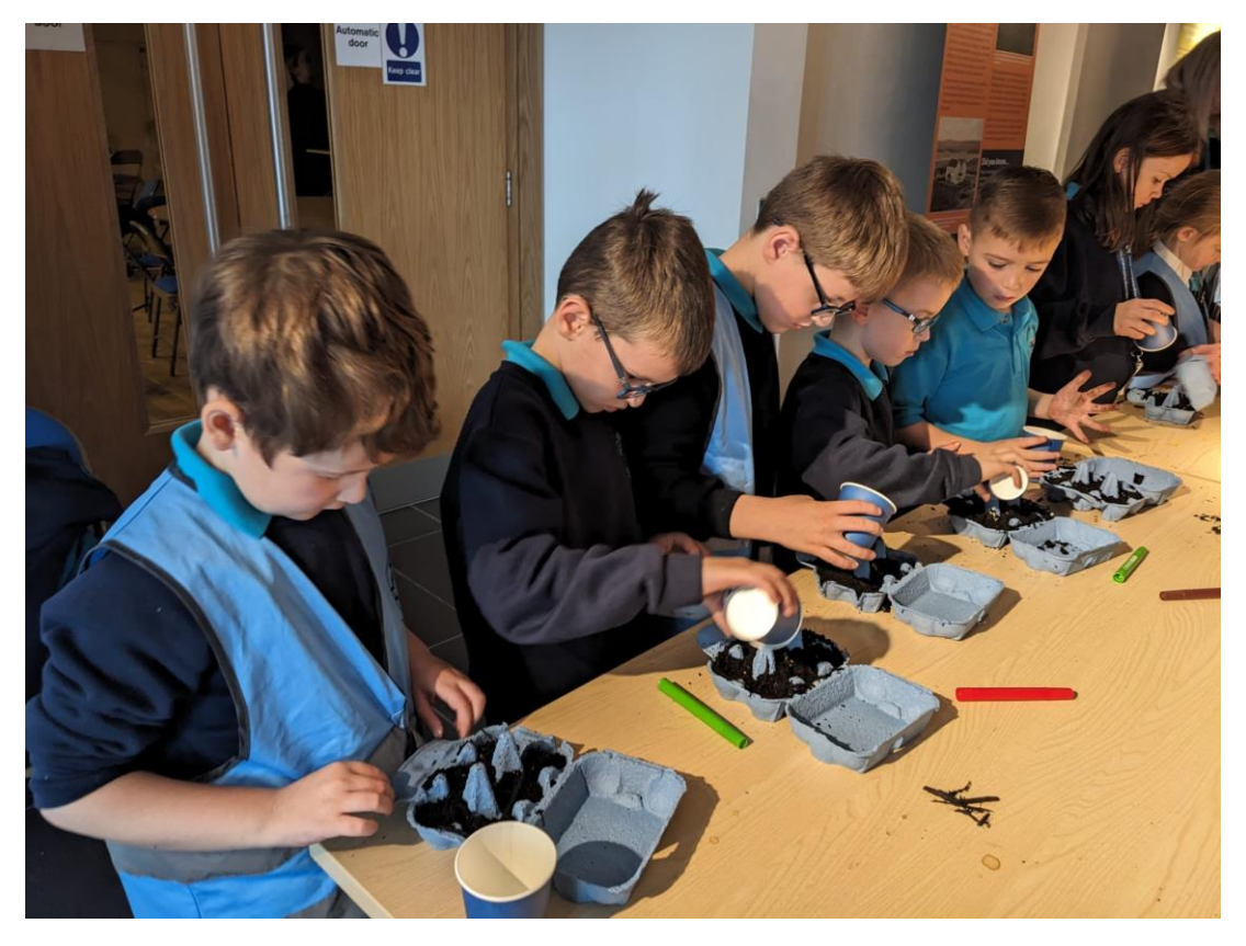
Pupils from Roe Valley Integrated Primary School planting wildflower seeds in egg boxes.