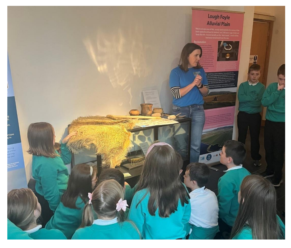
Looking at some of the museum collection objects to understand how our ancestors changed the local environment (Photo: CCGBC Museum Services).